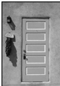
DOOR OF COMMUNITY FALL SABBATH OCTOBER 21-23, 2011