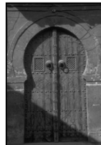
DOOR OF SPIRITUAL FORMATION THE PRAYER PATH JANUARY 5-7, 2012