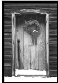
DOOR OF SERVICE SPIRIT VILLAGE DECEMBER 3, 2011